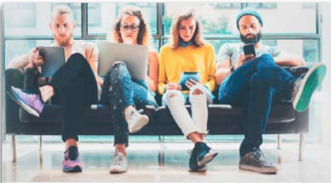
Job search in Denmark

We advise you to complete our four e-learning modules on job search in Denmark to get insight, knowledge, inspiration and tips on finding a job.