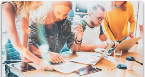
An introduction to Danish workplace culture