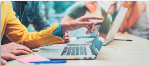
Using LinkedIn in your job search and professional network