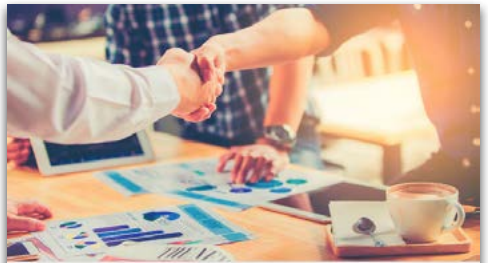
Contact companies and succeed in your job interviews